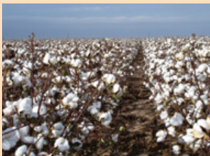
Loyd Jordan Farms Meadow, Texas, USA

"I can get 1,68 metric tons of cotton per hectare with 406 mm of drip water, but only 1,26 metric tons per hectare with 406 mm of pivot water. This means that I can get the same number of bales of cotton from 32 hectares of drip as I can get from 48 hectares of pivots. Why farm more acres for the same result? Yield, and crop per drop, is the bottom line."