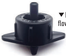
▼ Black Base nominal flow rate 4 l/h