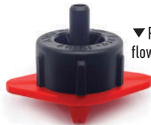
▼ Red Base nominal flow rate 8 l/h