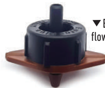
▼ Brown Base nominal flow rate 16 l/h